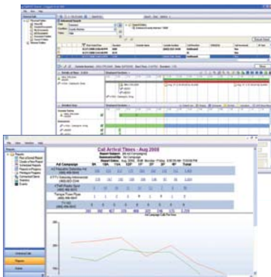
Tracer provides businesses with powerful real-time and historical perspective on the interactions occurring within the organization.

T R A C E R Professional Interaction Management